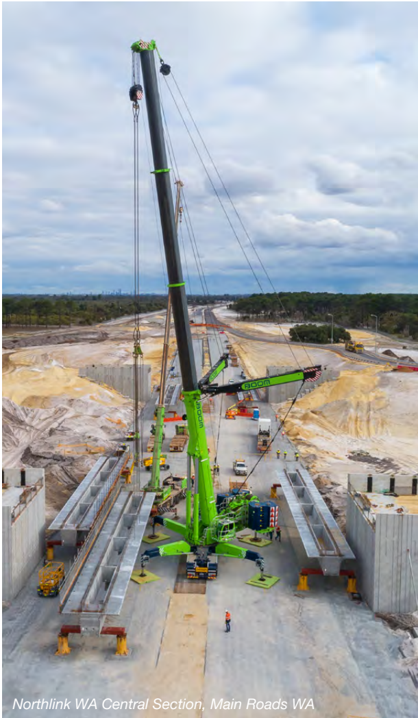
Northlink WA Central Section, Main Roads WA