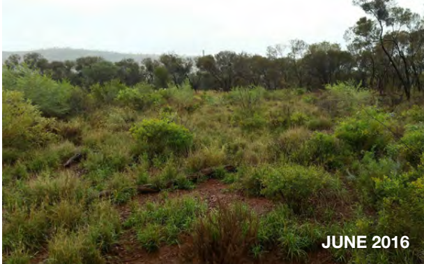
Temporary Workers Village, Tom Price.